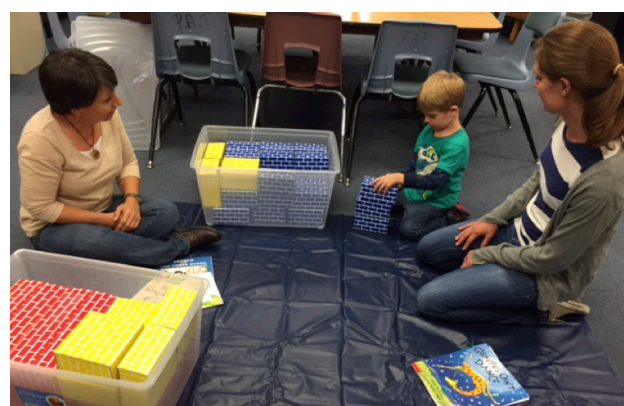
HOME VISITS BY CERTIFIED PARENT EDUCATORS