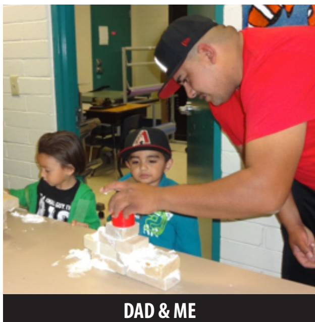
DAD & ME