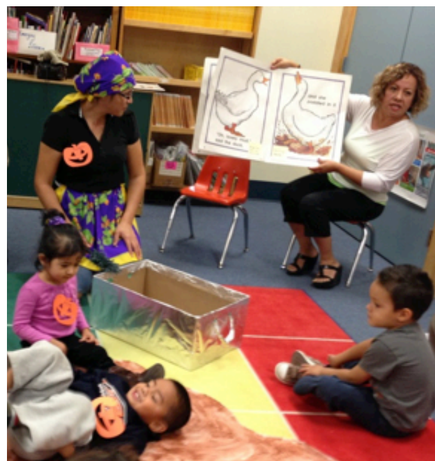
LIBRARY / STORY HOUR

Title I First Things First Professional Association of Women's Services Joseph Stanley Leeds Foundation Sunnyside Foundation Individual Donors