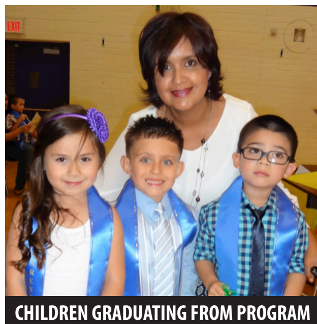
CHILDREN GRADUATING FROM PROGRAM