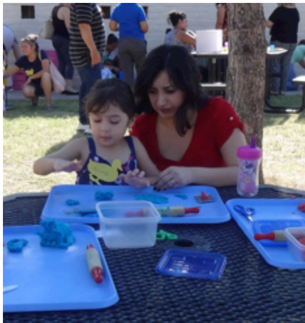
STAY & PLAY